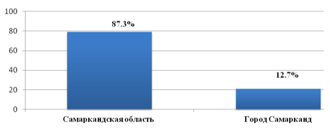
Fig. 2. Distribution of patients by place of residence