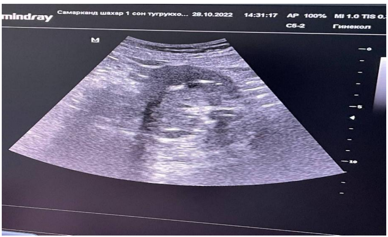
Fig. 1. The state of the receptive endometrium in patient A., 28 years old, control group

This ultrasound appearance is in good agreement with the emerging notion that the implanting embryo is rapidly and actively encapsulated by migrating decidual cells64. It remains to be seen whether the absence of decidual protrusion or encapsulation found on ultrasound can serve as an indirect marker of inadequate decidualization, and thus predict subsequent pregnancy loss.