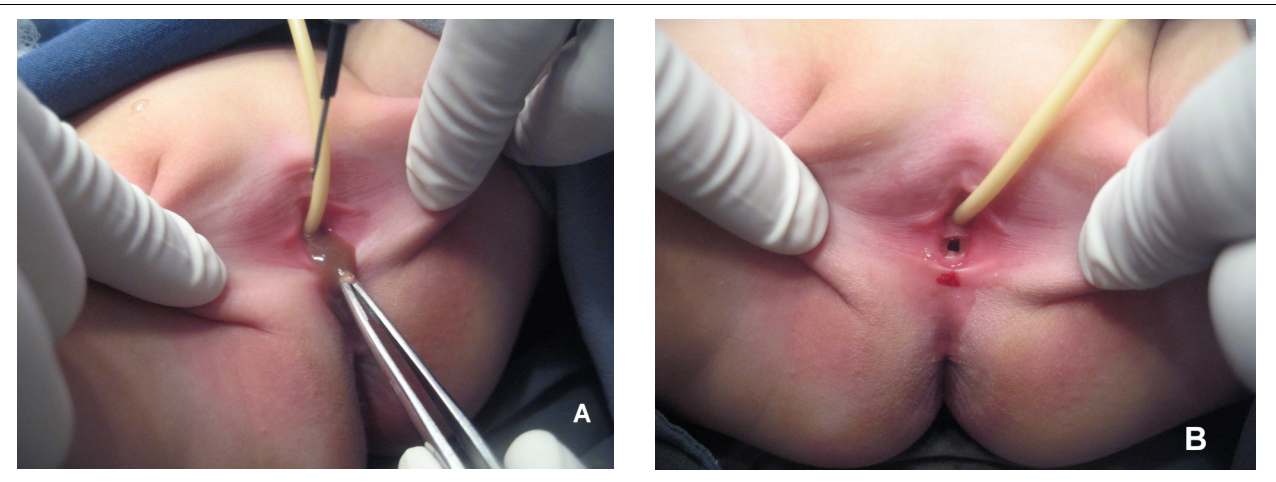
Fig. 3. Drainage of retained mucus after resection of hymenal tissue (A) and view of hymen immediately after surgery (B).

No prophylactic antibiotic was administered except 2 patients whom previously routine puncture and drainage of mucocolpos was performed.